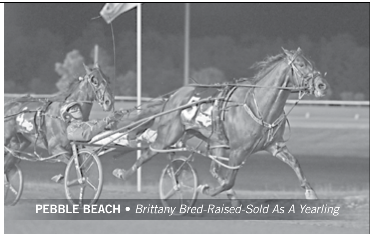
PEBBLE BEACH • Brittany Bred-Raised-Sold As A Yearling