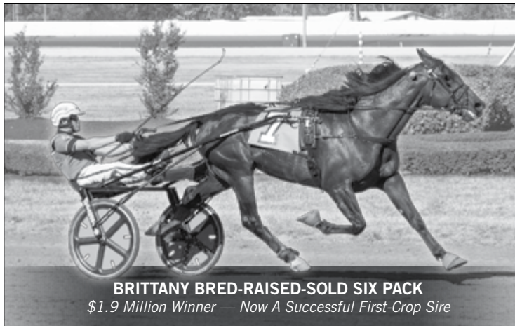
BRITTANY BRED-RAISED-SOLD SIX PACK $1.9 Million Winner — Now A Successful First-Crop Sire